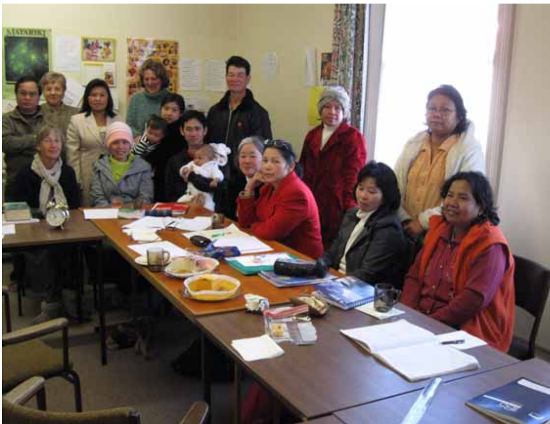
Successful Adult Learners – Our Literacy Class members spend 10 hours every week learning the difficult English language!

page 1 selects. You, our learners and tutors, are part of this – hopefully we all learn from what we do! So give yourself a big pat on the back and thanks you for all your efforts. I hope you can join us, with your family, on 12 September, so we can all celebrate this learning together.