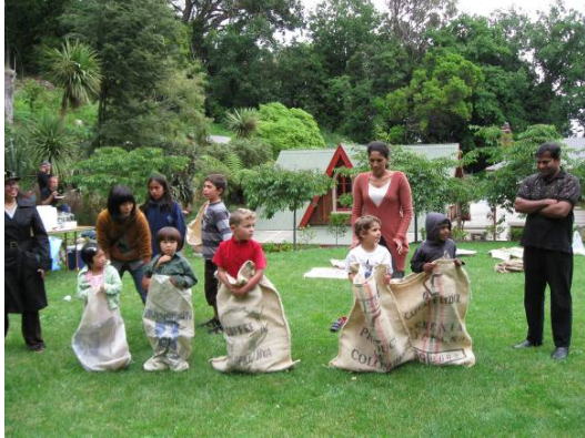
Competitors eagerly await the start of the sack race.

English Language Partners Nelson got together with the Nelson Multicultural Council for an end-of-year picnic at Fairfield House. About 100 people turned up and we managed to get in some great races (sack race, potato and spoon, and three-legged races to be precise) and a lovely variety of food before the rain started and we had to adjourn inside. The races certainly brought to light some previously unappreciated competitive instincts!